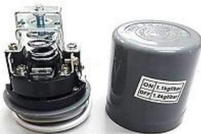
Pressure Switch (One Touch Point) 1.1kgf/bar