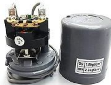
Pressure Switch (Two Touch Point) 1.8kgf/cm 2